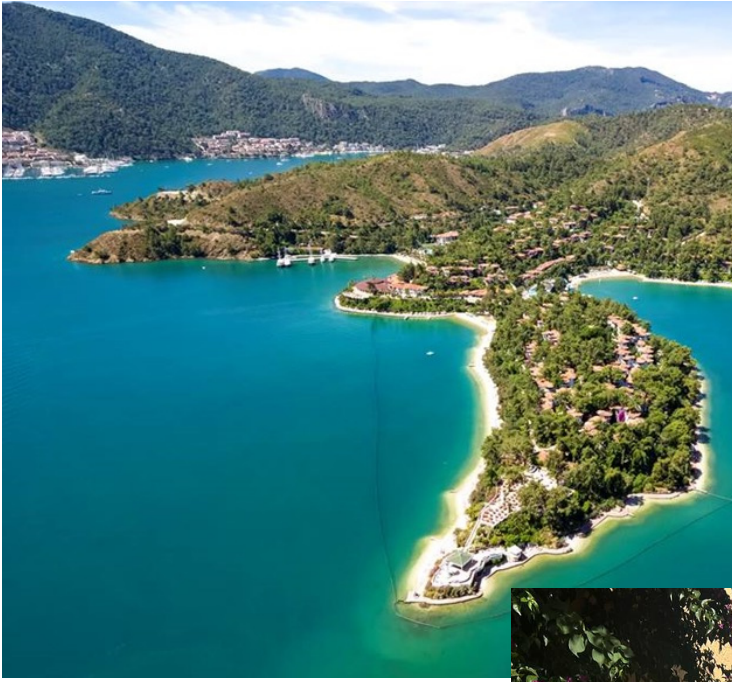
The Peninsula – home to Hotel Letonia