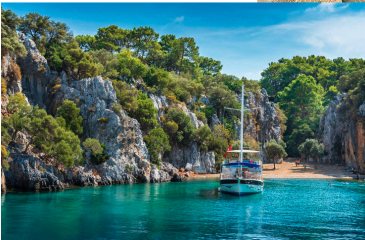
Boat trip to hidden coves