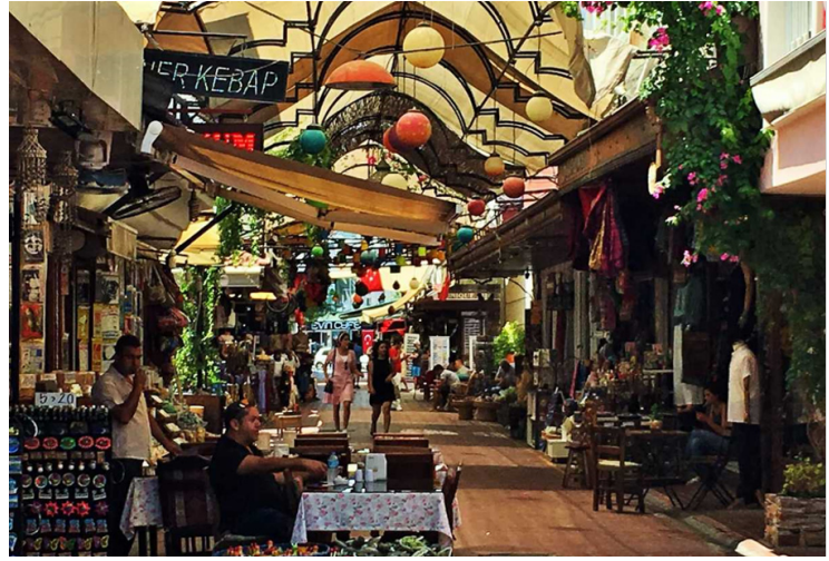
Fethiye Old Town